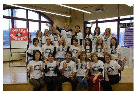
Siloam Mission-SUYS first shift

The 7th annual Soup Up Your Smile at the Siloam Mission showed to be yet another huge success. More than 500 Siloam Mission patrons benefited from the interactive displays, games, prizes & giveaways, and dental hygiene consultations, all organized by the Faculty of Dentistry's senior dental hygiene students in their efforts to promote oral health education and awareness while giving to those in need. Local businesses and individuals also showed great support in donating to the event.